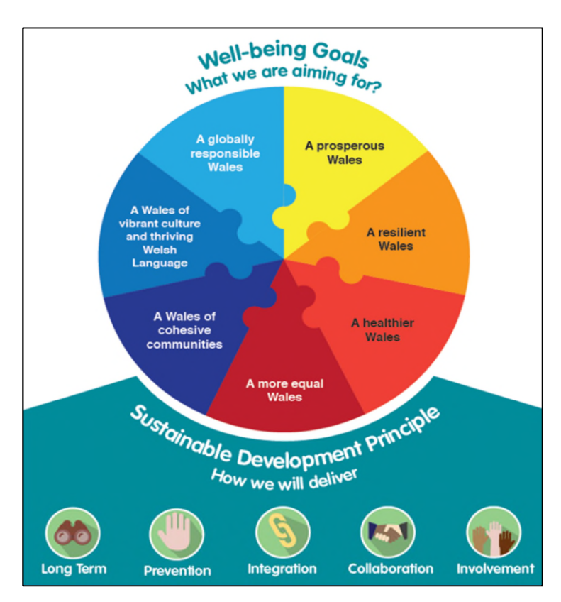
Figure 2: Well-being of Future Generations (Wales) Act 2015, Well-Being Goals and Sustainable Development Principle

Equally, the Sustainable Development Principle with its five ways of working are fundamental to the way in which active travel interventions should be planned and delivered: